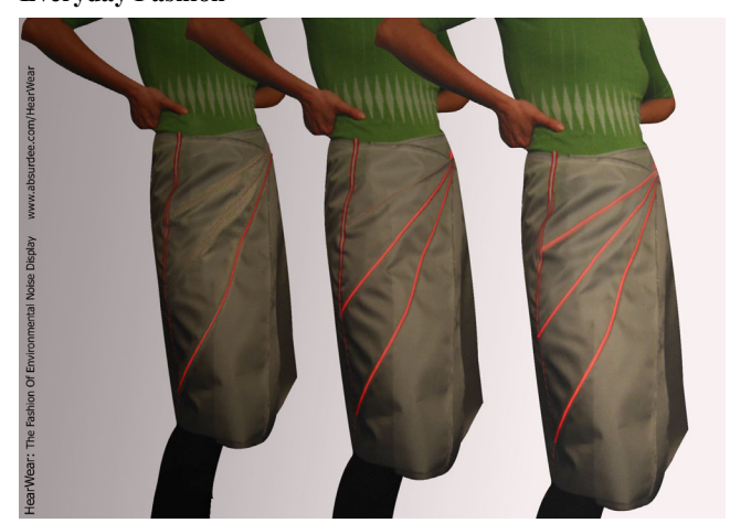
HearWear V.01A lit

HearWear's design embeds the underlying technology in a very discrete way. Even when it is not turned on, it is equally fashionable, attractive and comfortable. We work towards a